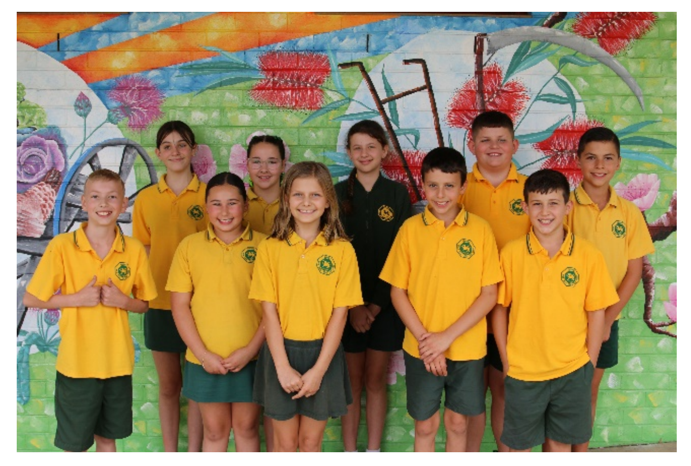
2024 Student Leadership Team